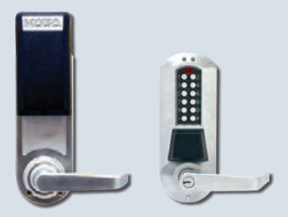
1. Inside Mount Option

For optimized operations, a ZigBee Gateway is powered from the USB when only one Gateway is required, and Power Over Ethernet (PoE) supplies power when a configuration includes multiple Gateways and a network. A plug-in transformer can also power a ZigBee Gateway or Router (no PoE is available).